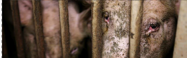
Let's open our eyes