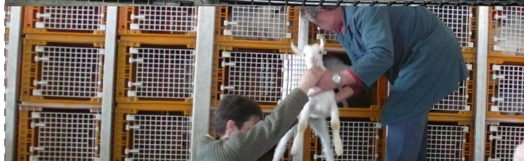
we can save their lives